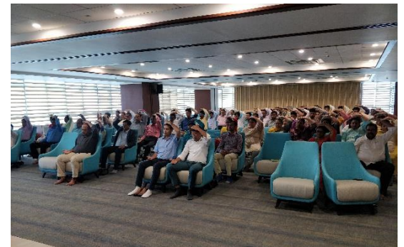
Corporate program at BKC