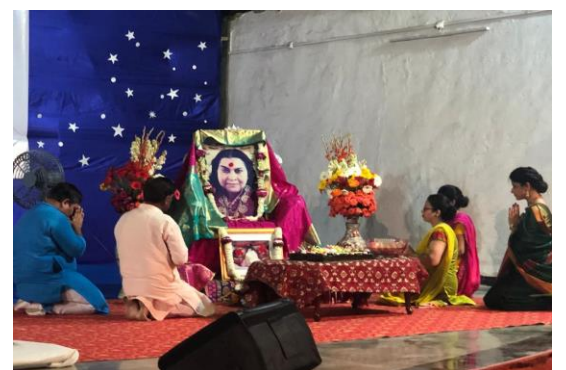
24 th Anniversary of Health Centre, CBD Belapur