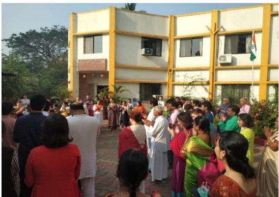
Republic Day Celebration at Health Centre

Sahaja Yoga, Andheri Collectivity organized a public program on 26 th January 2020 at Gulmohar Park & Kalavishar Manoranjan Park near Versova Village between 6:00 AM to 09:00 AM. More than 100 new seekers attended it. Follow up programs were conducted every Thursday thereafter.