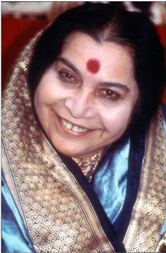
HER HOLINESS MATAJI SHREE NIRMALA DEVI

"You have to use the candle and it will be all right. Because whatever it is, you see, it's a left side virus you have got, virus, infection. And for the virus you have to use the light. Light. Light is more than the heat. It's not the heat, it's the light that will help you a lot. ... It's just a virus infection of what you call the allergic. Allergic conditions are nothing but viruses, allergic. And these viruses are the plants and things that have gone out of the circulation of evolution. So, they live on the left-side, in the collective subconscious, you see, the area which was built in. And they attack you. Once they attack you, then medical cannot cure it, you see. It's a psychosomatic trouble. And now in his case also same thing. Only the candle can cure it. ... You have to use my photograph."