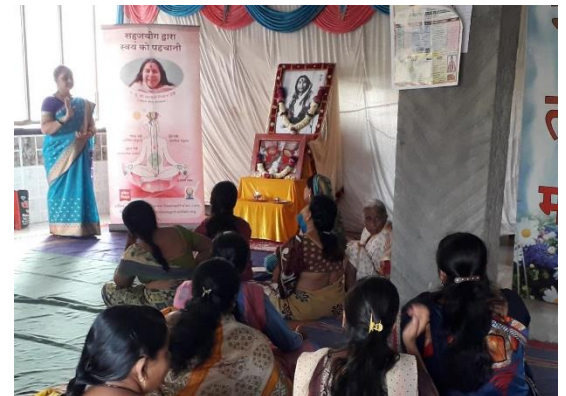
Public Program at Vasind