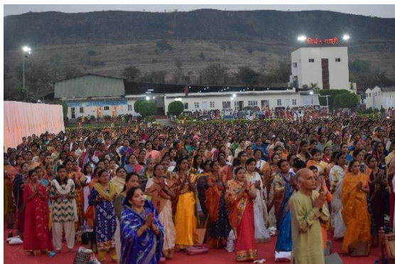
International Shree Shiv puja, Bhugaon