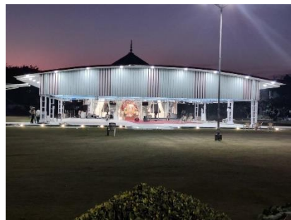
Birthday Puja at Nirmal Dham, Delhi