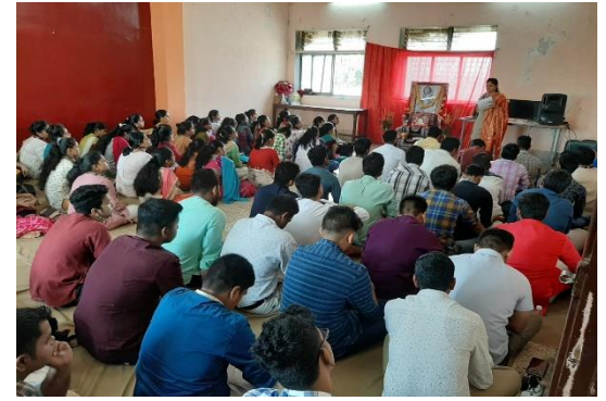
Yuvashakti Seminar at Dadar

The workshop which was held on 12 th March 2020 at Sahaja Yoga Mumbai Main Centre Andheri, was based on how different notes of Indian classical music affects the vibratory awareness or state. The flow was started by lubricating all the points of Vishuddhi chakra by Ghee so that vibrations can be felt on a more sensitive level. Then we moved each chakra starting from Mooladhara to Sahasrara reciting the respective Bija mantra, Shlok or Bhajan collectively along with the musical Team. Yuvas from West zone attended the Workshop.