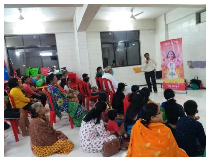
Public Program at Titwala