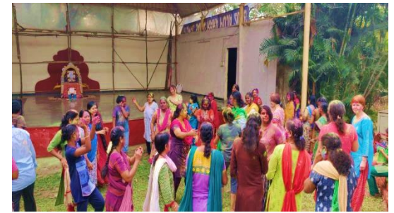
Holi Celebration at Health Centre, CBD Belapur