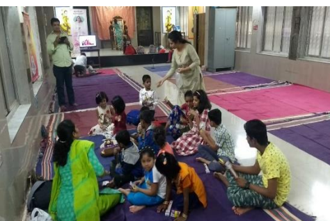
Children Seminar- East Zone