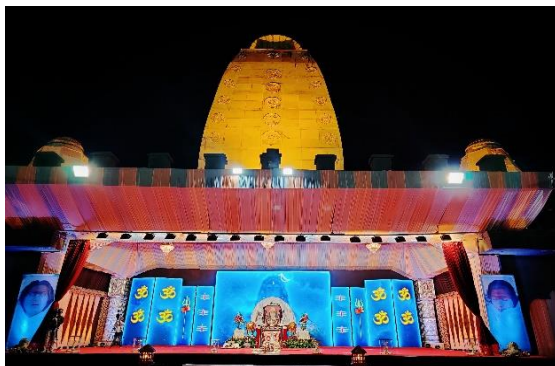
Birthday Puja at Health Centre, CBD

The International Birthday Puja was offered at the Lotus feet of Shree Mataji on March 21, 2020 at Nirmal Dham, Delhi. Sahaja Yogis participated in the Puja online from their respective homes. It was webcast live on YouTube page of Nirmal Dham by The Life Eternal Trust, Delhi.