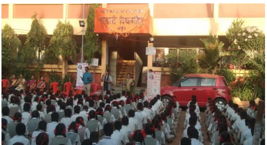
Public Programs in School