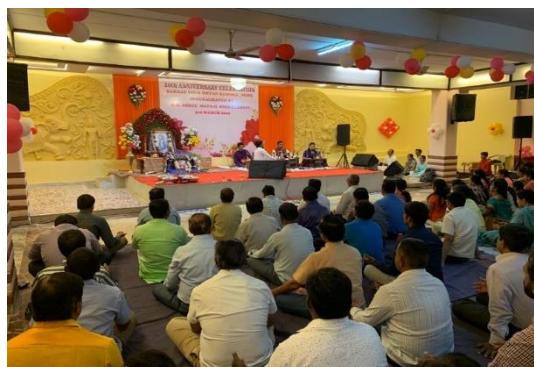
20 th Anniversary, Sahaja Yoga Dhyam Kendra, Kothrud