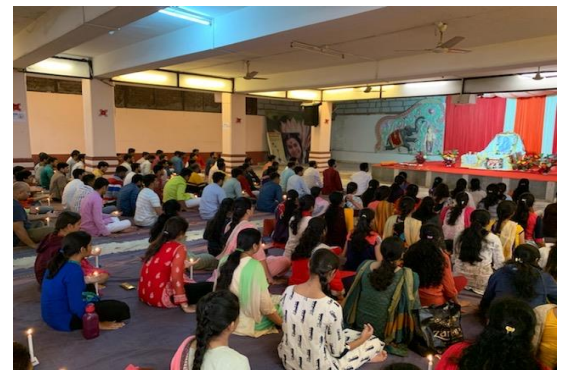
Yuvashakti workshop, Kothrud

Every Sahaj yogi has had miraculous experiences at the Health Centre in different ways. One such from yogi shared about his critical stage cancer. He was suffering from throat cancer, which eventually had spread to other organs in the body. When he visited the Health Centre, he realized the importance of regular meditation and treatments. With complete dedication and attention to Sahaja yoga and Shree Mataji, he left India after a few days of his treatment. It surprised all the doctors in New Zealand when they learned about the absence of cancer tumors in any of his organs. The experience made Sahaja Yogi's faith stronger ever since.